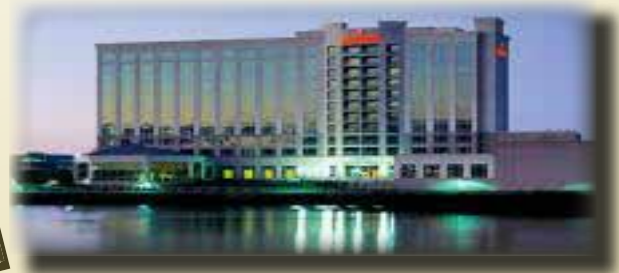
Indianapolis Marriott North, Keystone

M ark your calendars now for the 2012 Corn Belt Seed Conference.