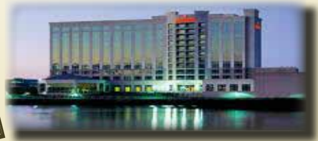
Indianapolis Marriott North, Keystone

M ark your calendars now for the 2012 Corn Belt Seed Conference.